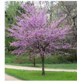
CERCIS CANADENSIS EASTERN REDBUD