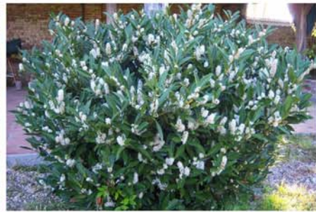
HEIGHT: 3'-4' SPREAD: 6'