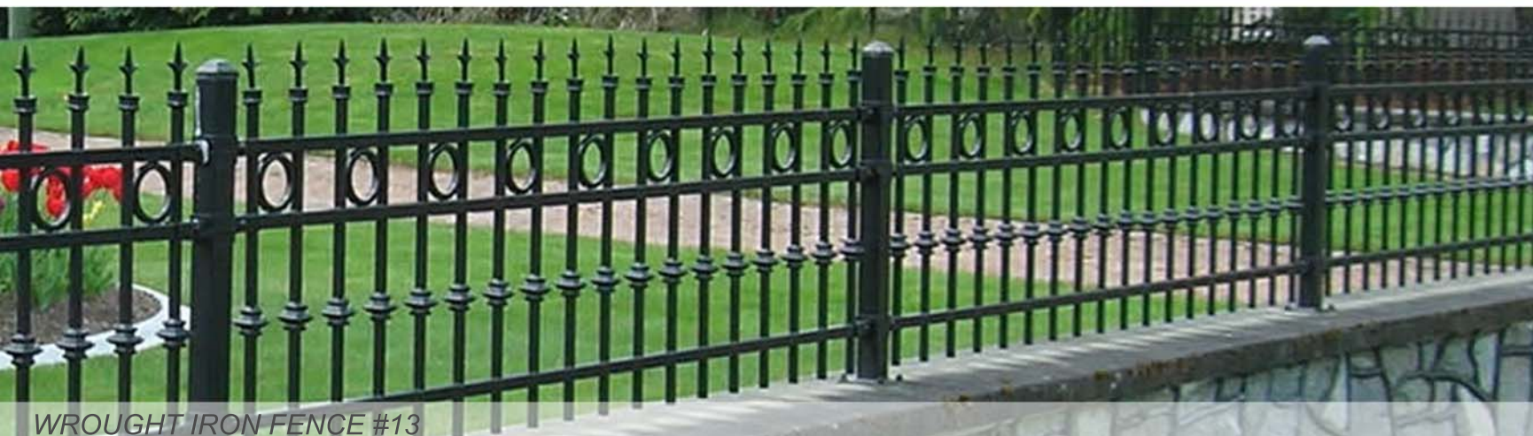
WROUGHT IRON FENCE #13