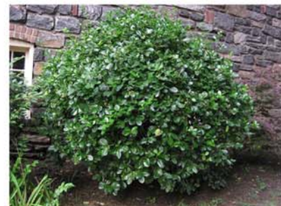
EUONYMUS KIAUTSCHOVICUS 'MANHATTAN' EUONYMUS