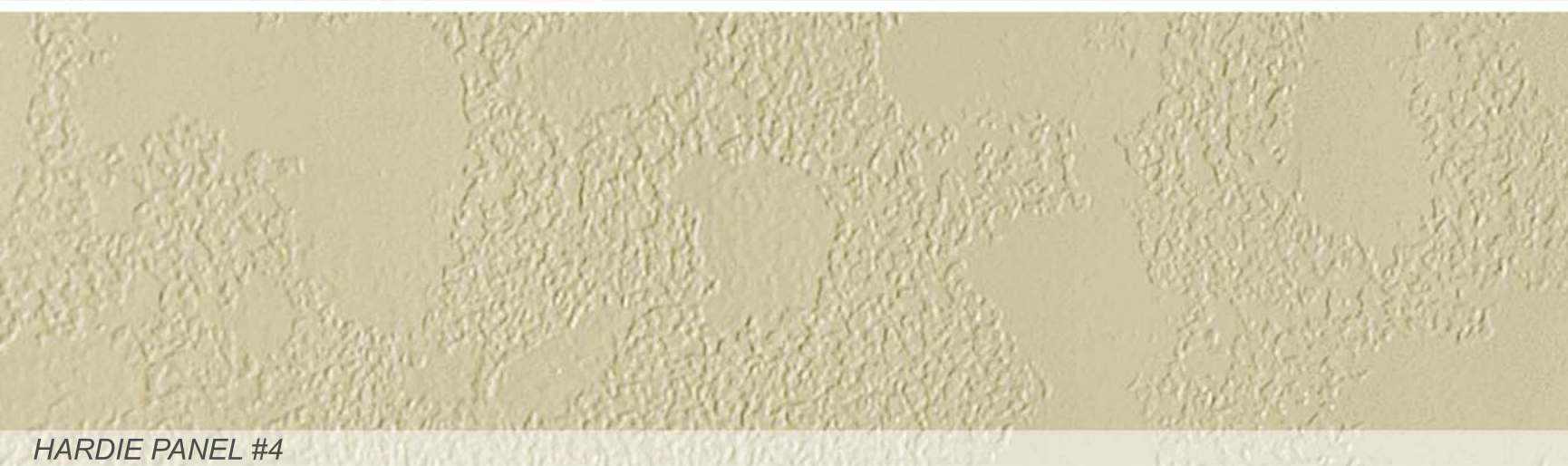
HARDIE PANEL #4