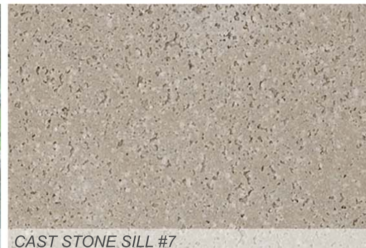
CAST STONE SILL #7