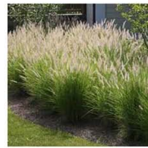
PENNISETUM ALOPECUROIDES 'HAMELN' FOUNTAIN GRASS