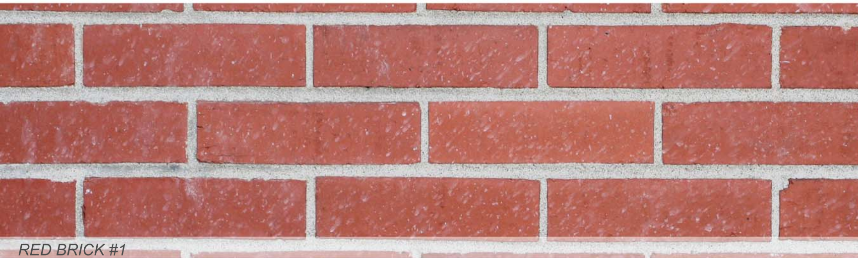
RED BRICK #1