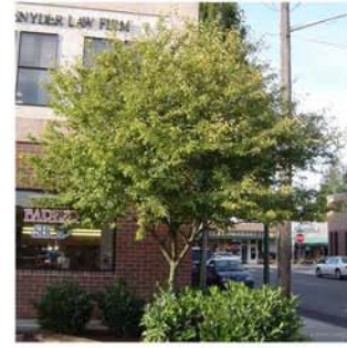
AMELANCHIER X GRANDIFLORA 'AUTUMN BRILLIANCE' AUTUMN BRILLIANCE SERVICEBERRY