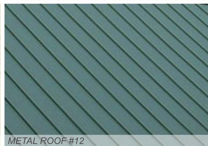
METAL ROOF #12