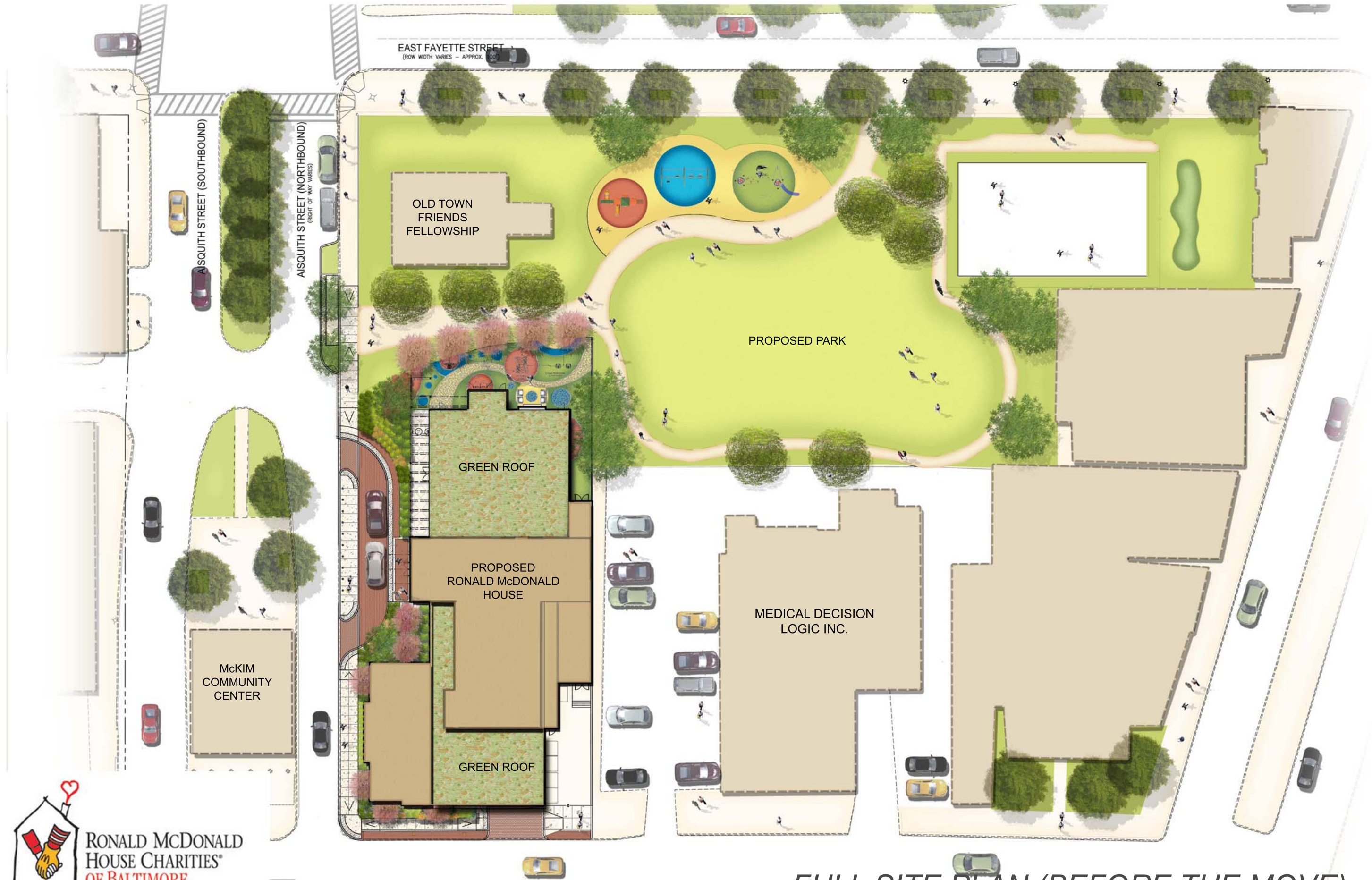
FULL SITE PLAN (BEFORE THE MOVE)