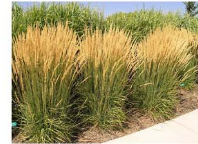
CALAMAGROSTIS X ACUTIFLORA 'KARL FOERSTER' FEATHER REED GRASS