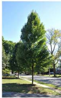
ACER X FREEMANII 'ARMSTRONG' ARMSTRONG MAPLE