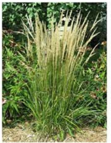
HEIGHT: 3'-4' SPREAD: 1.5'-2.5'