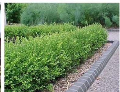
HEIGHT: 3'-4' SPREAD: 3'-5'