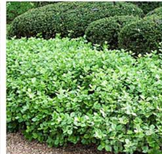
HEIGHT: 4'-6' SPREAD: 3'-5'