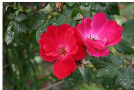
ROSA 'RADRAZZ' KNOCKOUT ROSE