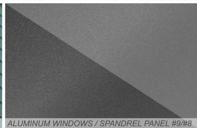
ALUMINUM WINDOWS / SPANDREL PANEL #9/#8