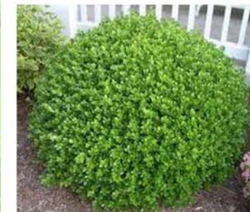
BUXUS SINICA VAR. INSULARIS 'WINTERGREEN' KOREAN BOXWOOD