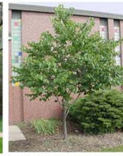
HEIGHT: 20'-30' SPREAD: 25'-35'