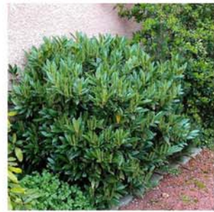
PRUNUS LAUROCERASUS 'OTTO LUYKEN' CHERRY LAUREL