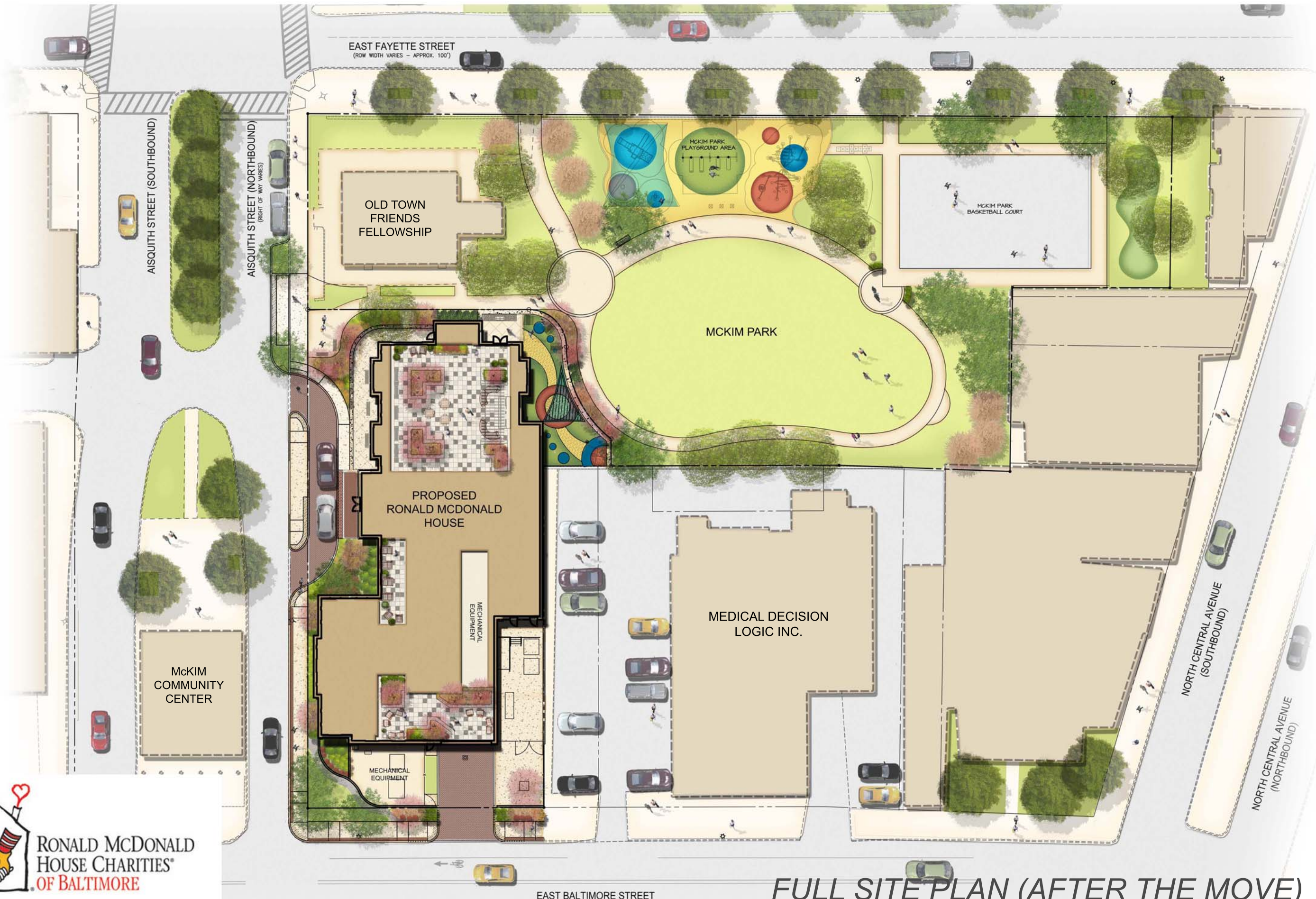
FULL SITE PLAN (AFTER THE MOVE)