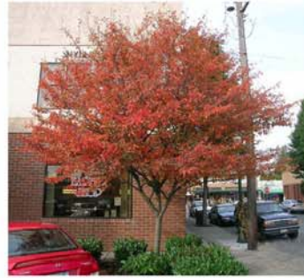
HEIGHT: 15'-25' SPREAD: 15'-25'