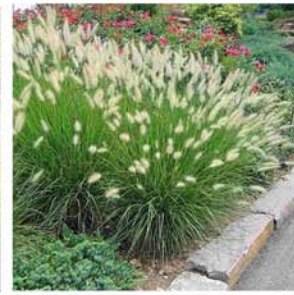
HEIGHT: 1.5'-2.5' SPREAD: 1.5'-2.5'