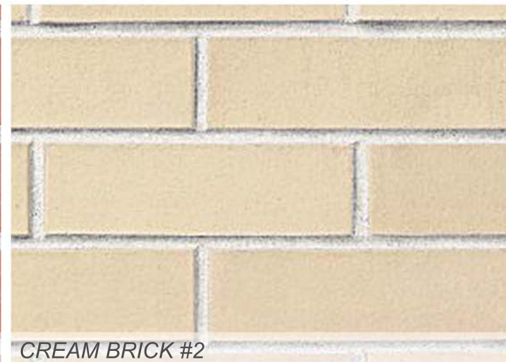
CREAM BRICK #2