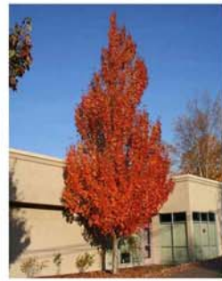
HEIGHT: 50'-70' SPREAD: 10'-15'